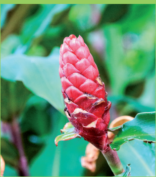
Costus comosus x vargasii Greg Jones cold hardy costus collection.

This gorgeous new hybrid has broad leaves with purple undersides and strong stems. The plant is compact, medium sized, grows in filtered light and produces large showy inflorescences spring to summer. Prefers well drained rich soil.