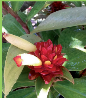
Costus 'Maureens Choice' Greg Jones cold hardy costus collection.

A medium to tall robust grower that is proving to be super cold hardy. It prefers medium sun to part shade and well drained rich soil. It has a touch of purple under the leaves and flowers spring to summer. A great addition to any tropical garden.