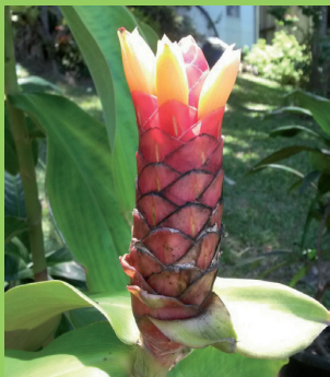
Costus 'Oxley Orange' Greg Jones cold hardy costus collection.

A tall, robust plant with attractive bamboo-like markings on the stems. Produces bright red cones and edible yellow flowers tipped with red in spring to summer. This plant is cold hardy and can handle medium sun to part shade and rich well drained soil.