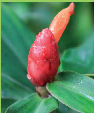
Costus belize x vargasii Greg Jones cold hardy costus collection.

This stunning new hybrid features strong erythrophyllus leaf and stem colour and is cold hardy. The plant is compact, medium sized, prefers filtered light and well drained rich soil. A great plant for small tropical gardens. The inflorescences are large and showy. Flowers spring to summer.