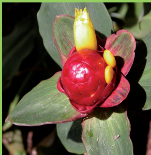
Costus 'Royal Burgundy' Greg Jones cold hardy costus collection.

A gorgeous new hybrid with compact growth. It requires a shady protected position in well drained rich moist soil. Flowers spring to summer. A great addition to a tropical garden.