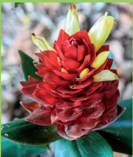
Costus 'Oxley Ruby' Greg Jones cold hardy costus collection.

A striking costus with attractive foliage of large green leaves with maroon undersides, and rich maroon spiralling stems. Grows to 2m in part shade, rich well drained soil. Flowers spring to summer. A must for all tropical gardens.