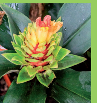
Costus 'Midori Magic' Greg Jones cold hardy costus collection.

This stunning new hybrid features strong broad leaves with purple underside and a strong stem. The plant is compact, medium sized, grows in filtered light and produces large showy inflorescences spring to summer. Prefers well drained rich soil.