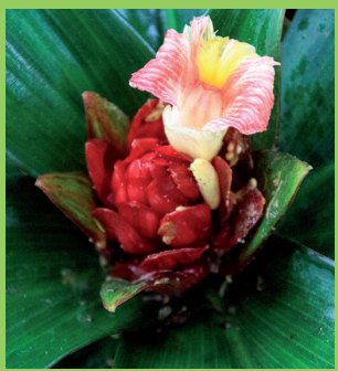
Costus 'Maroon Magic' Greg Jones cold hardy costus collection.

A tall robust grower with beautiful red stems. Produces bright red bracts and yellow flowers spring to summer. Prefers medium sun to part shade and rich well drained soil. A great landscaping plant.