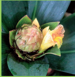
Costus 'Art Magic' Greg Jones cold hardy costus collection.

This stunning new hybrid features strong erythrophyllus leaf and stem colour and is cold hardy. The plant is compact, medium sized, prefers filtered light and well drained rich soil. A great plant for small tropical gardens. The inflorescences are large and showy. Flowers spring to summer.