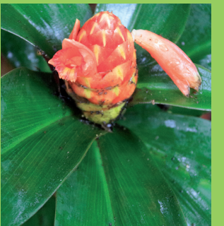
Costus 'Tangerine Magic' Greg Jones cold hardy costus collection.

A wonderful new hybrid featuring broad leaves with purple undersides and strong stems. The plant is compact, medium sized, and grows in light shade and well drained rich soil. Produces large showy inflorescences in spring to summer.