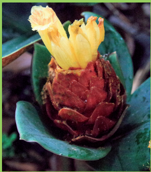
Costus 'Royal Magic' Greg Jones cold hardy costus collection.

It is a medium grower with maroon stems and under leaf colour. It prefers filtered light and rich well drained soil. It flowers spring to summer producing inflorescences featuring large-bright red bracts and yellow flowers and are supported by sturdy stems. This is a great landscaping plant.