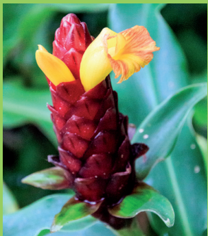
Costus 'Oxley Compic' Greg Jones cold hardy costus collection.

The main reason to hybridise these gingers was to produce cold hardy, colourful forms of costus while looking out for unusual variations. Of course there are universal variants such as location, growing conditions, sun or shade, temperature fluctuations and altitude but there is huge potential for designer plants. Some of these new hybrids are already growing and flowering in Melbourne eg. Oxley Orange.